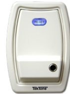
single and dual patient stations