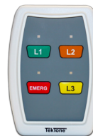
4-button staff peripheral station