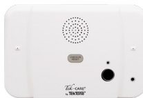
single/dual patient stations