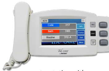
master station with handset and desk mount housing