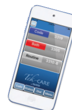
Tek-CARE® Staff App for iPhone, iPad, iPod touch and Apple TV® and Android devices