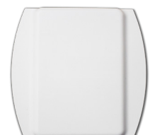
auxiliary input module