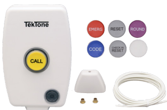
water-resistant emergency pull-cord station shown with 6 standard button caps for call types, with optional pull cord: CALL, EMERG, CODE, RESET, ROUND, and CHECK-IN