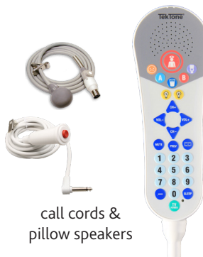
call cords & pillow speakers

(except for paging equipment, call cords, pillow speakers, the Tek-CARE Central Equipment, and refurbished equipment, which have a one-year warranty). See www.tektone.com/warranty.pdf for details.