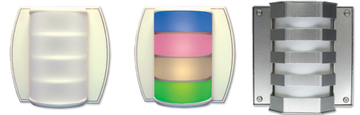
corridor light with 4 programmable-color LEDs, and optional vandal-resistant dome cover (plug-on zone light module also available)