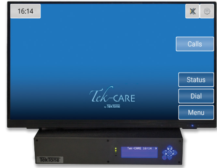
Tek-CARE® Central Equipment with Tek-CARE® Reporting Software